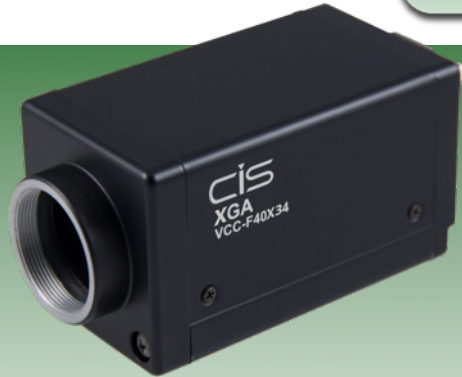
XGA ANALOG COLOR CAMERA