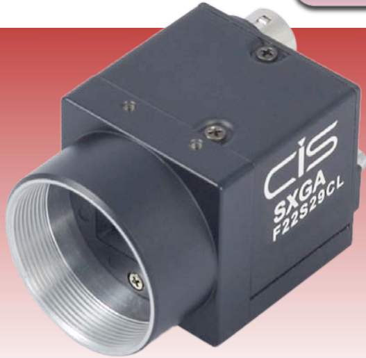
1/2" SXGA COLOR CCD VISION CAMERA AT 25 FPS