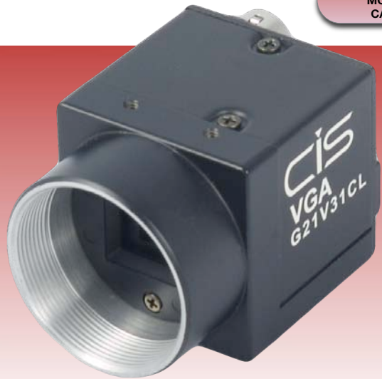
1/3" VGA MONOCHROME CCD VISION CAMERA AT 120 FPS